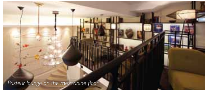
Pasteur lounge on the mezzanine floor

We recommend the Louvre suite. Blessed with all the home comforts you could desire, from the spacious bathroom with Jacuzzi bath, to the oversized two-tone couch and sumptuous sleeping area, just don't be tempted to stay in the room! Get your day off to a good start with a leisurely breakfast in bed, or why not get stuck into the hotel's extravagant breakfast buffet served in the stunning vaulted cellar? With many of the mouth-watering offerings sourced from local producers, such as the delicious buttered croissants, Danish pastries, speciality breads and continental meats and cheeses, you'll soon recharge those batteries for a spot of city sightseeing.