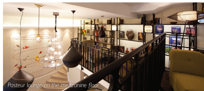
Pasteur lounge on the mezzanine floor

We recommend the Louvre suite. Blessed with all the home comforts you could desire, from the spacious bathroom with Jacuzzi bath, to the oversized two-tone couch and sumptuous sleeping area, just don't be tempted to stay in the room! Get your day off to a good start with a leisurely breakfast in bed, or why not get stuck into the hotel's extravagant breakfast buffet served in the stunning vaulted cellar? With many of the mouth-watering offerings sourced from local producers, such as the delicious buttered croissants, Danish pastries, speciality breads and continental meats and cheeses, you'll soon recharge those batteries for a spot of city sightseeing.